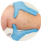
Have had a blood clot before