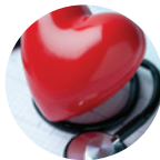
Have heart problems such as heart failure

If any of these describe you, talk to your specialist, doctor or nurse about what you can do to reduce your risk. Keep reading the rest of this booklet for tips on reducing your risk. 2